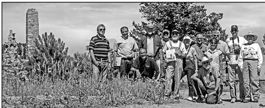
The Denver, Boulder & Western field trip group at the Mt. Altos park picnic area.