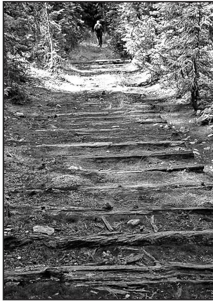
Dan Edwards hiking ahead on the Silverton Railroad grade away from turntable.

Although the focus of our trip was to visit Otto Mears Silverton Railroad's Corkscrew Turntable area, drivers of 4-wheelers got an early start on their trip content on Friday with an "in-context approach" to Silverton from the east over Engineer Pass, while drivers of regular cars enjoyed the more conventional, though still narrow-gauge-authentic, Million Dollar Highway route through Ridgway and Ouray from the north.