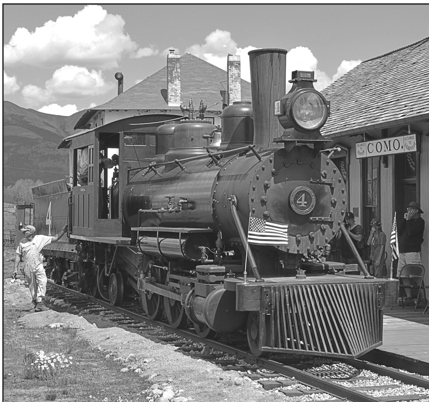
Restored ex-Klondike Mines Railway #4, renamed “Klondike Kate,” posed at the restored Como depot during Boreas Pass Railroad Day activities on Saturday, August 19, 2017.