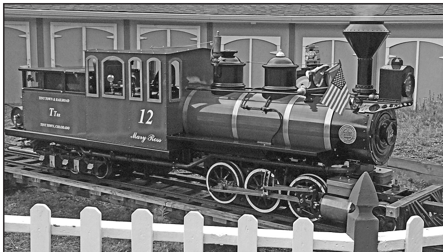
Tiny Town's 7-1/2 inch gauge Mason Bogie.